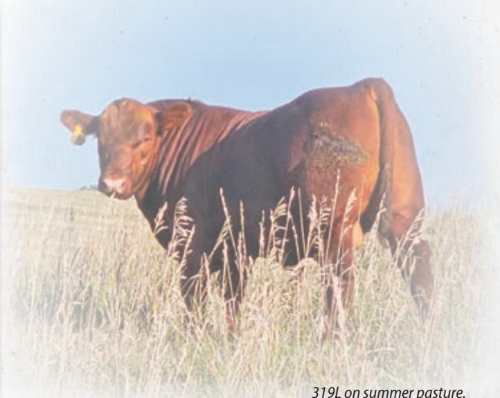
319L on summer pasture.