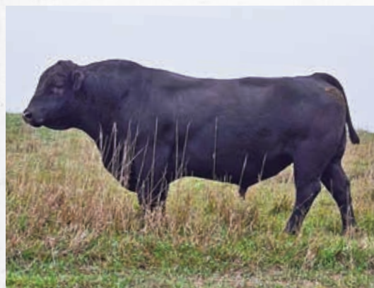
D&D NEXT STEP 01H Sire to 323L-327L